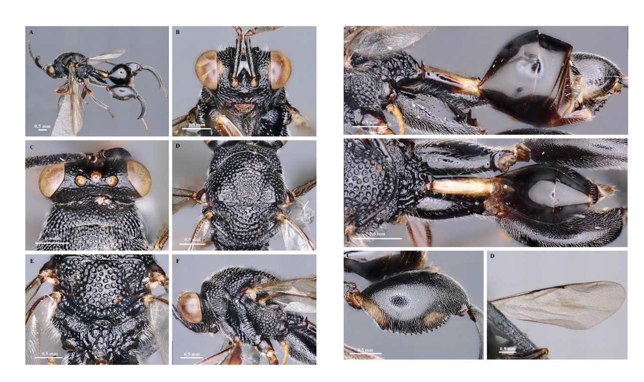
Fig. 1 Chalcis biligiriensis sp. nov. , holotype, female-A) Habitus, in lateral view; B) Head, in anterior view; C) Head, in dorsal view; D) Mesosoma, in dorsal view; E) Scutellum and propodeum, in dorsal view; F) Head and mesosoma, in lateral view