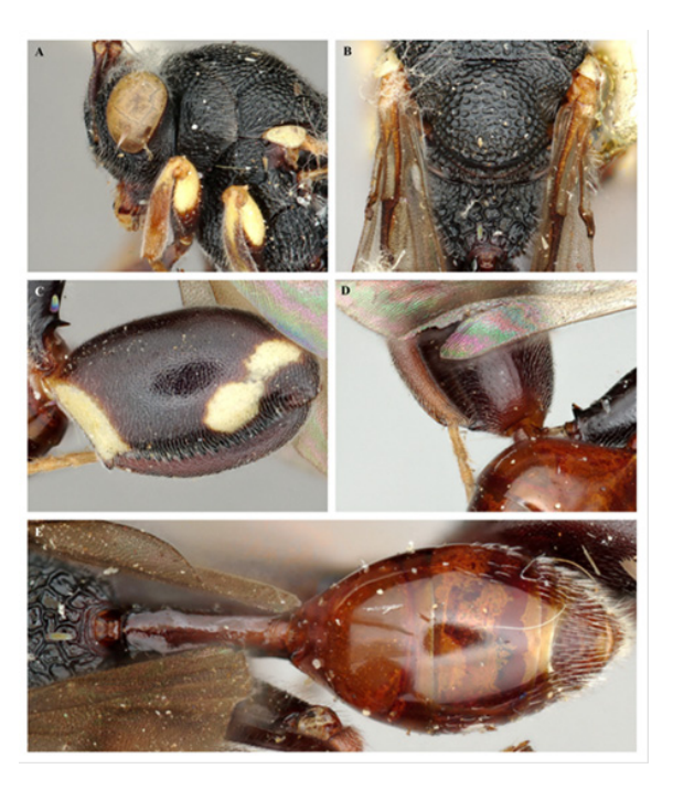
Fig. 5 Chalcis gibsoni Narendran, holotype, female - A) Head and mesosoma, in lateral view; B) Propodeum, in dorsal view; C) Hind femora, in lateral view; D) Hind femora, in ventro-lateral view; E) Gaster, in dorsal view

(Fig. 2B); post marginal vein shorter than marginal vein (Fig. 2D); second gastral tergite with single row of setae (Figs 1A, 2A) [India] ..... Chalcis biligiriensis sp. nov.