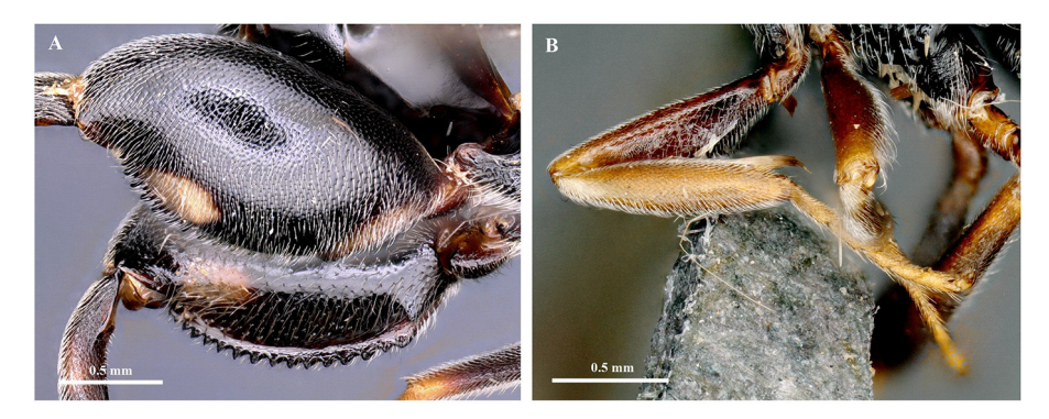
Fig. 3 Chalcis biligiriensis sp. nov. , holotype, female - A) Hind femora, in ventro-lateral view; B) Fore leg