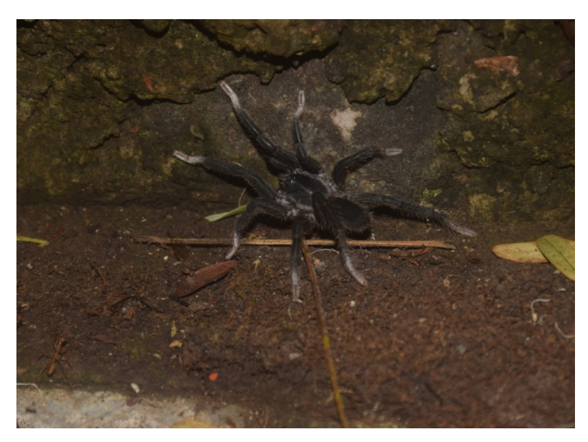
Fig. 1 Habitat of Annandaliella travancorica Hirst 1909