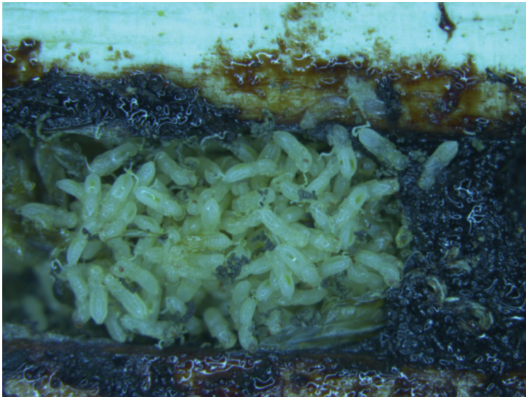
Fig. 3 Prepupae of Melittobia sp. in a leaf cutter bee cell