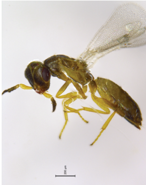
Fig. 2 Adult female Melittobia sp.