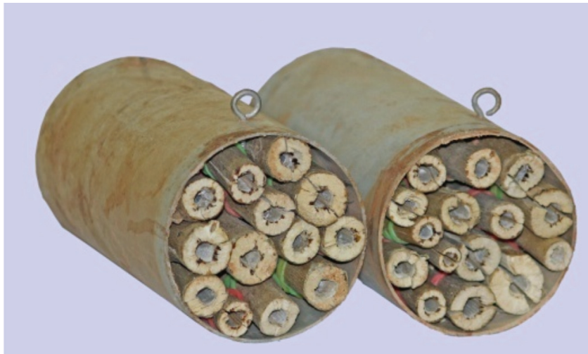
Fig.1 Reeds of Ipomea cornea used for trap nesting Megachile spp.

Of the four species of leaf cutter bees, M. lanata recorded the greatest parasitisation (54.55%) with 1581 parasitoid adults emerging from 30 cells with an average of 52.7 per cell. 72.22 per cent of the 18 cells constructed by M. lerma were parasitized by Melittobia , with 647 adults emerging from 13 cells with an average of 49.76 per cell. From among the cells of the unidentified species of Megachile , a total of 515 parasitoid adults emerged from 63.88 per cent of the cells with a mean of 57.22 per cell. Lowest parasitisation was recorded in M. disjuncta (33.33%) with only 163 parasitoid adults emerging from three cells (54.33/cell). From the remaining 16 nests (93 cells) only Melittobia adults emerged indicating 100 per cent parasitisation (Table 1; Fig. 4). A total of 3116 parasitoid adults emerged from these nests with an average of 33.50 per cell. On an average, 40 Melittobia adults emerged per cell, irrespective of the species of Megachile (Fig. 5). This is the first record of Melittobia hawaiiensis species group parasitizing Megachile spp. in India.