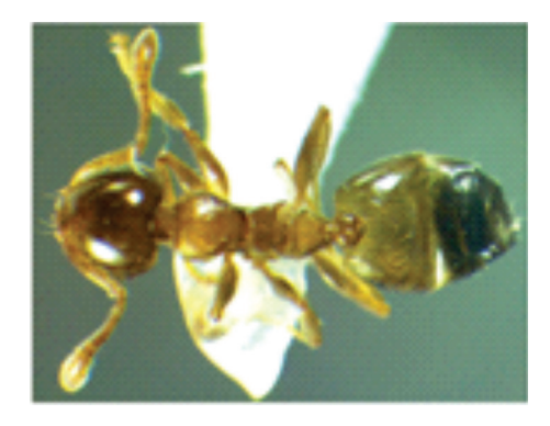
Fig. 4 Crematogaster biroi