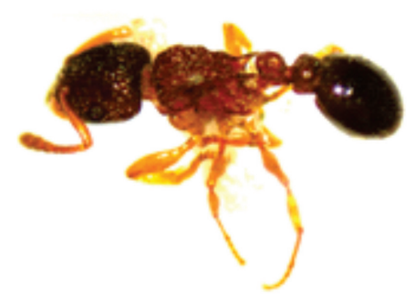
Fig. 5 Tetramorium bicarinatum