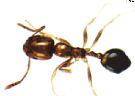
Fig. 1 Trichomyrmex aberrans