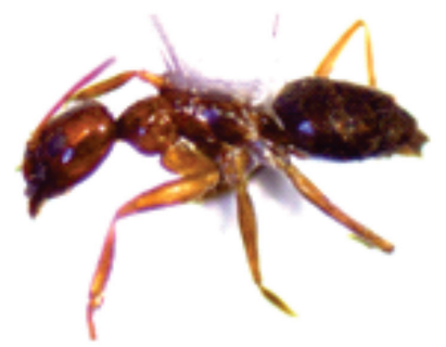
Fig. 2 Nylanderia indica