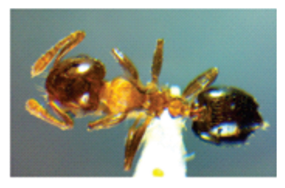
Fig. 3 Crematogaster anthracina