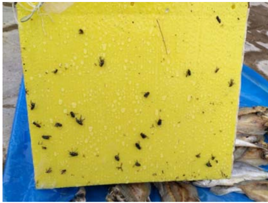
Plate 2. Yellow sticky trap with trapped flies (Control)