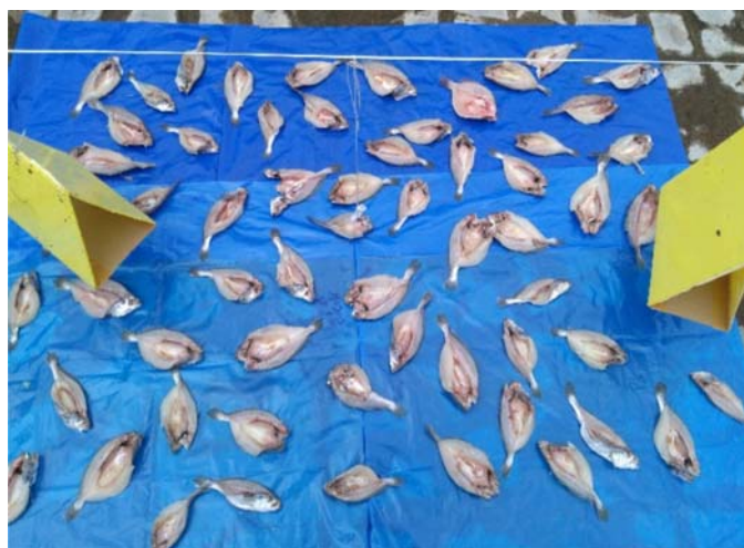
Plate 1. Drying plot with repellent & trap (Experimental)

Multiple choice preference study of C. megacephala conducted with salt cured fish and with successive stages of drying reveals significant differences in their preference. Among the choices, the fish dried one day after a day's salt curing (SCDF 1D) obtained the maximum eggs which was