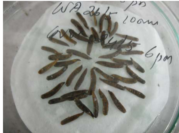
Fig. 2 White trapped cadavers of maggots

Cadavers subjected to White's trap (Fig.2) resulted in emergence of EPNs and the cause of infection was confirmed. Newly emerged nematodes collected and preserved as aqua suspension in double distilled water always lived more than 5 days.