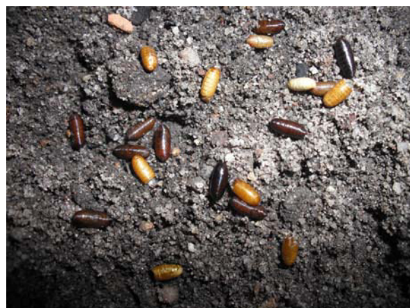
Fig.5 Infected pupae in the field