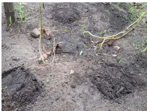
Fig.4 Experimental field