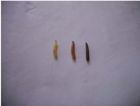
Fig. 1 Maggots - Before and after inoculation